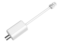
LR1002 ePoE Over Coax Converter